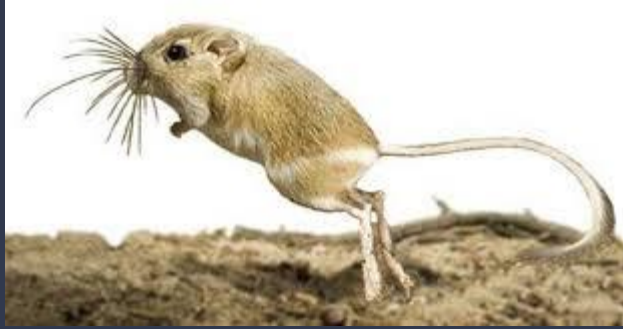
A Kangaroo Rat